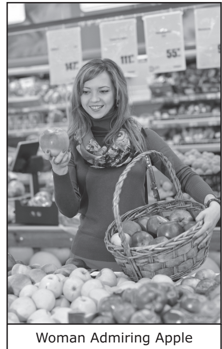
Woman Admiring Apple