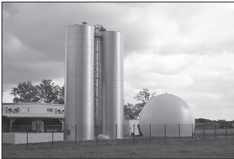
Anaerobic digester silos trap methane gas.